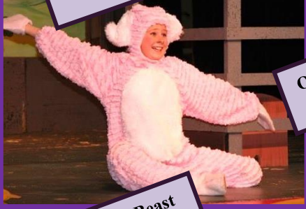
Charlotte's Web 2007