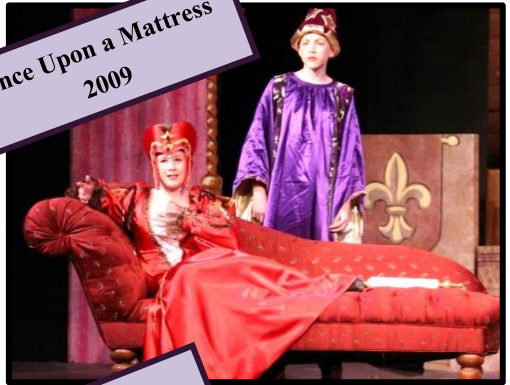
Once Upon a Mattress 2009